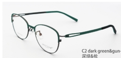
C2 dark green&gun 深绿&枪