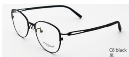
C8 black 黑