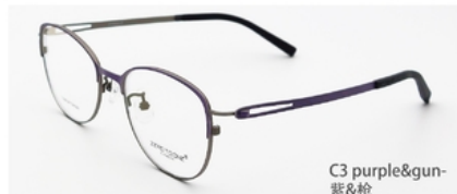
C3 purple&gun 紫&枪