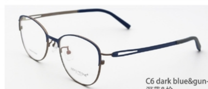
C6 dark blue&gun 深蓝&枪