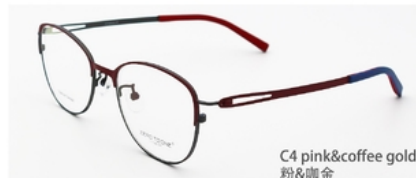
C4 pink&coffee gold 粉&咖金