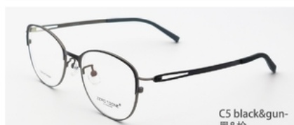
C5 black&gun 黑&枪