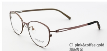
C1 pink&coffee gold 粉&咖金