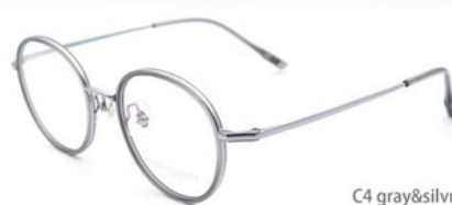
C4 gray&silvry 灰&银