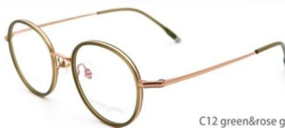
C12 green&rose gold 绿&玫瑰金