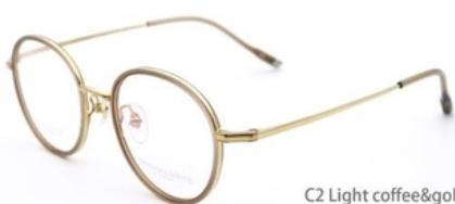
C2 Light coffee&gold 浅咖&金