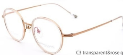
C3 transparent&rose gold 透明&玫瑰金