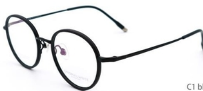
C1 black 黑