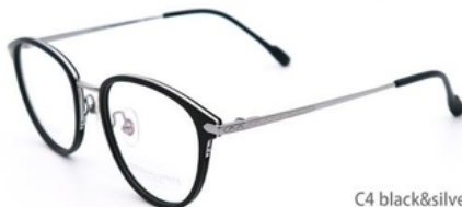
C4 black&silvery 黑&银