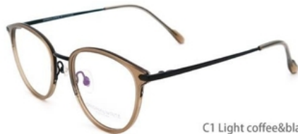
C1 Light coffee&black 黑