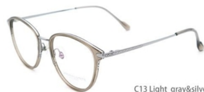
C13 Light gray&silvery 浅灰&银