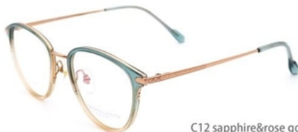
C12 sapphire&rose gold 宝石蓝&玫瑰金