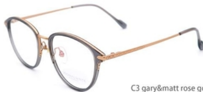
C3 gary&matt rose gold 灰&哑玫瑰金