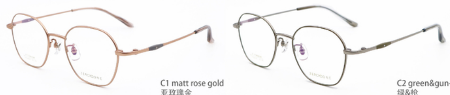
C1 matt rose gold 亚玫瑰金