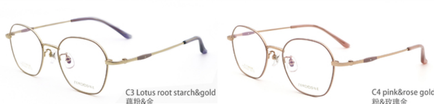
C3 Lotus root starch&gold 藕粉&金