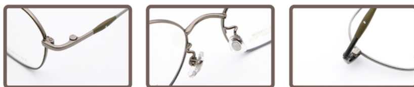
C4 pink&rose gold 粉&玫瑰金