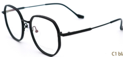
C1 black 黑