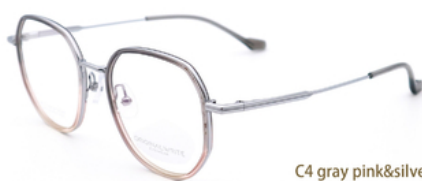
C4 gray pink&silvery 灰粉&银