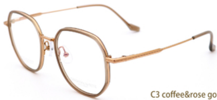
C3 coffee&rose gold 咖&玫瑰金