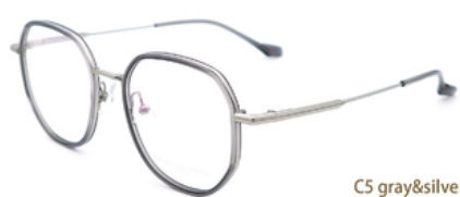
C5 gray&silvery 灰&银