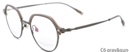
C6 gray&gun- 灰&枪