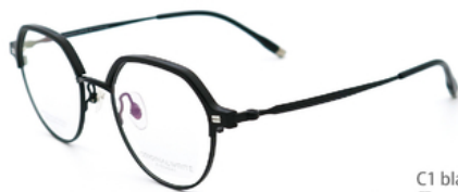
C1 black 黑