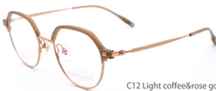
C12 Light coffee&rose gold 浅咖&玫瑰金