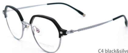
C4 black&silvery 黑&银