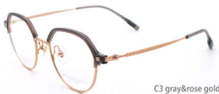
C3 gray&rose gold 灰&玫瑰金