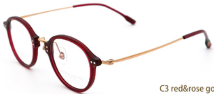
C3 red&rose gold 红&玫瑰金