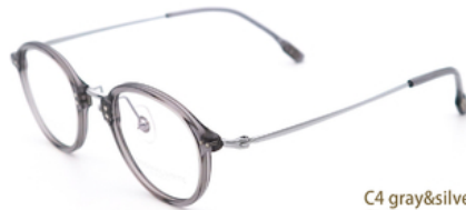
C4 gray&silvery 灰&银