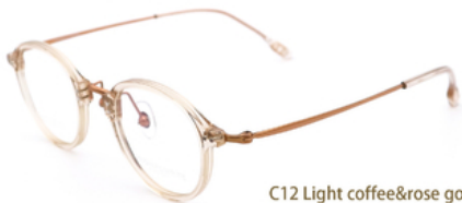
C12 Light coffee&rose gold 浅咖&玫瑰金