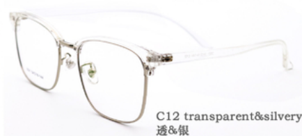
C12 transparent&silvery 透&银