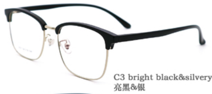
C3 bright black&silvery 亮黑&银