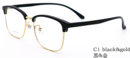
C1 black&gold 黑&金