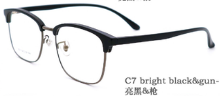
C7 bright black&gun- 亮黑&枪