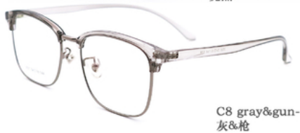
C8 gray&gun- 灰&枪