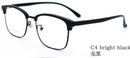
C4 bright black 亮黑