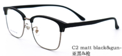
C2 matt black&gun- 亚黑&枪