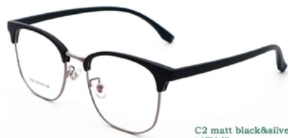
C2 matt black&silvery 哑黑&银