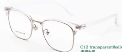
C12 transparent&silver 透明&银