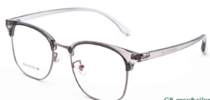
C8 gray&silvery 灰&银