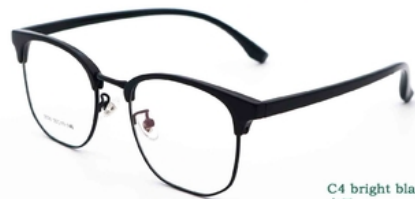
C4 bright black 亮黑