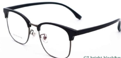
C7 bright black&gun- 亮黑&枪