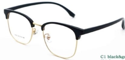
C1 black&gold 黑&金