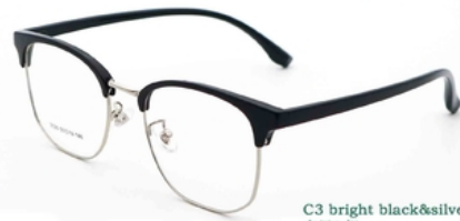
C3 bright black&silvery 亮黑&银