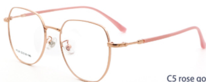
C5 rose gold 玫瑰金