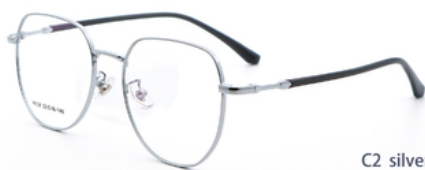
C2 silvery 银