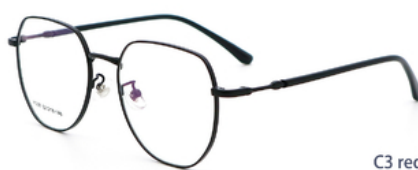
C3 red 红