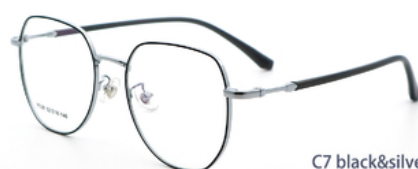
C7 black&silvery 黑&银