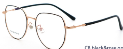
C8 black&rose gold 黑&玫瑰金