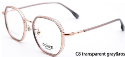
C8 transparent gray & rose gold 透 & 玫瑰金