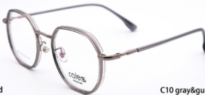
C10 gray & gun-gray 灰 & 枪