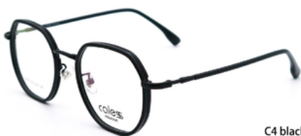
C4 black 黑