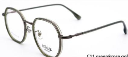
C11 green & rose gold 绿 & 玫瑰金