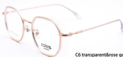
C6 transparent & rose gold 透 & 玫瑰金