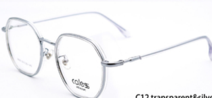
C12 transparent & silver 透明 & 银