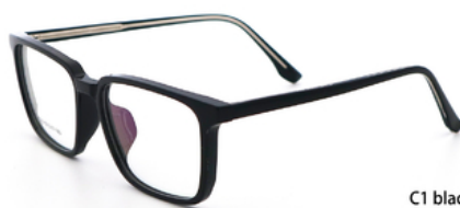
C1 black 黑