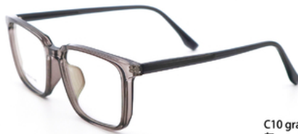
C10 gray 灰