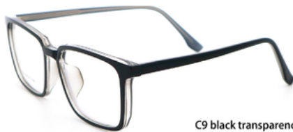
C9 black transparency 黑透