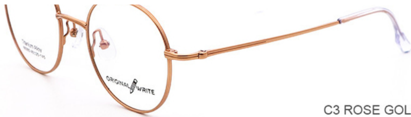
C3 ROSE GOLD