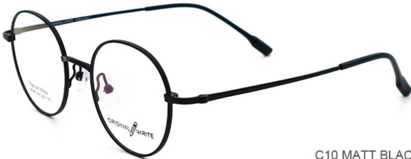
C10 MATT BLACK