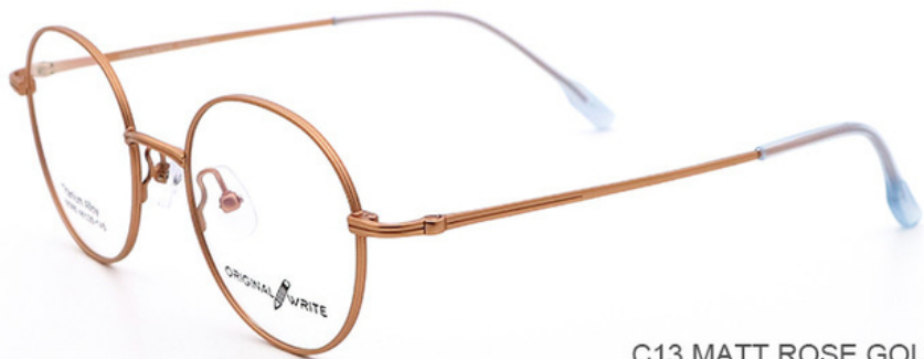
C13 MATT ROSE GOLD