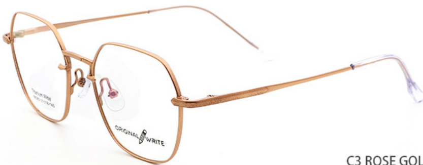
C3 ROSE GOLD