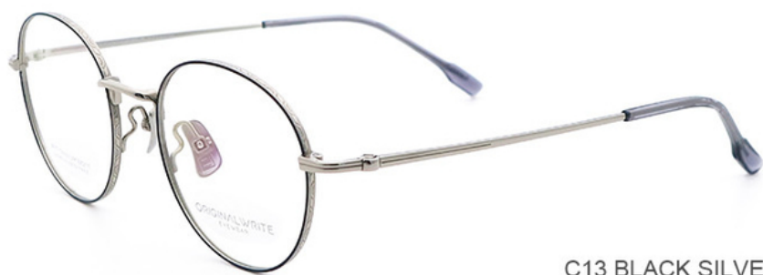
C13 BLACK SILVER