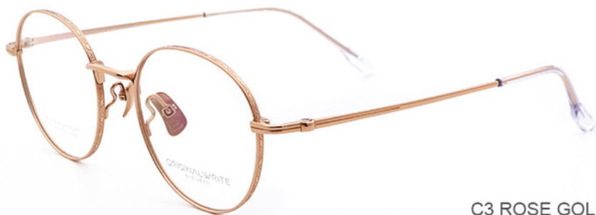
C3 ROSE GOLD