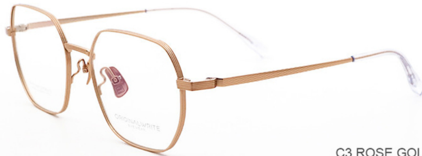
C3 ROSE GOLD