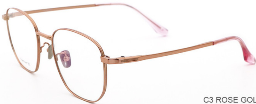
C3 ROSE GOLD