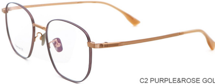
C2 PURPLE&ROSE GOLD