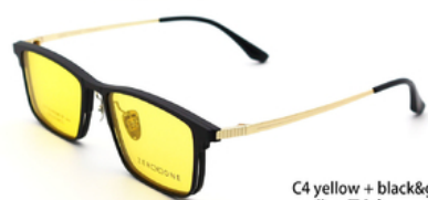
C4 yellow + black&gold 黄 + 黑&金