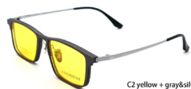
C2 yellow + gray&silvery 黄 + 灰&银