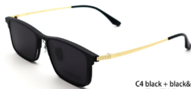
C4 black + black&gold 黑 + 黑&金