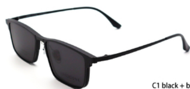
C1 black + black 黑 + 黑