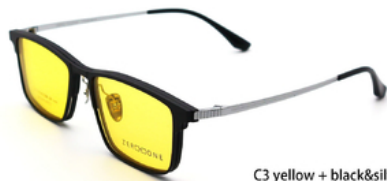
C3 yellow + black&silvery 黄 + 黑&银