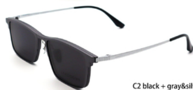
C2 black + gray&silvery 黑 + 灰&银