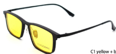
C1 yellow + black 黄 + 黑