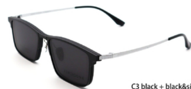
C3 black + black&silvery 黑 + 黑&银