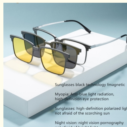
Sunglasses black technology fmagnetic