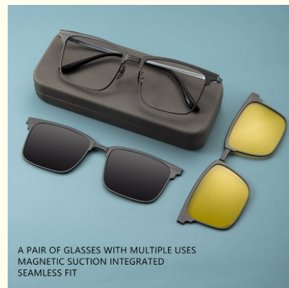
A PAIR OF GLASSES WITH MULTIPLE USES MAGNETIC SUCTION INTEGRATED SEAMLESS FIT