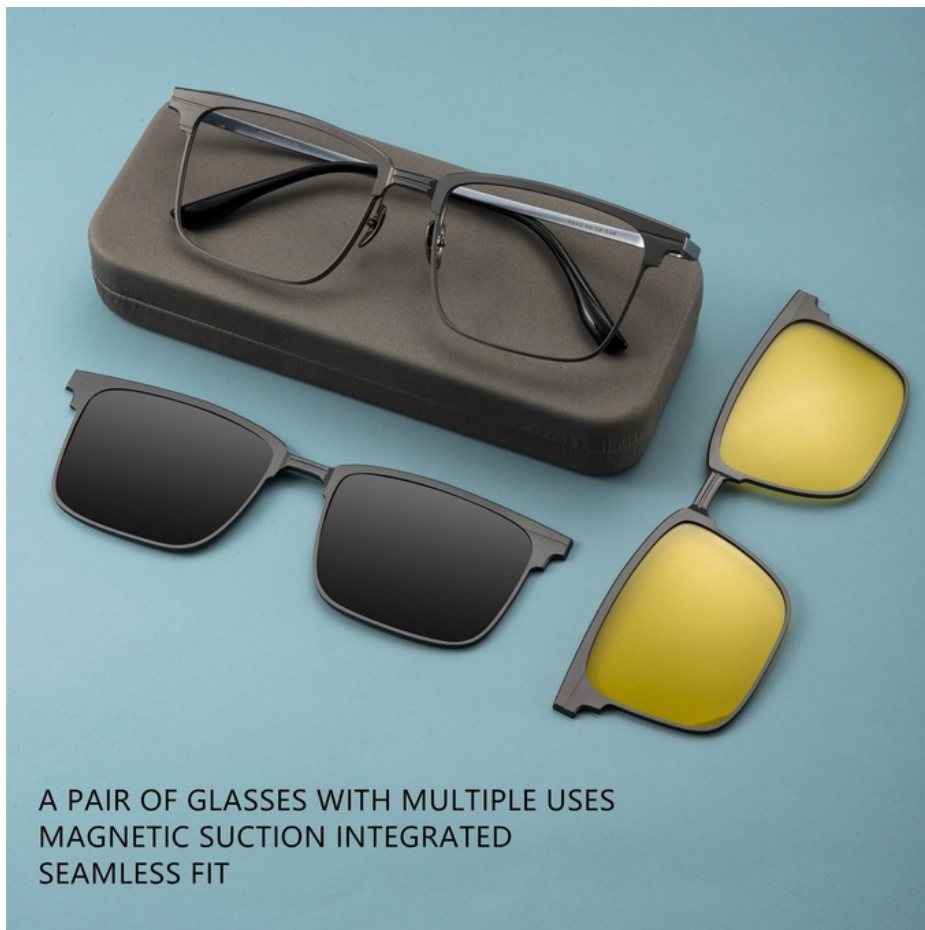
A PAIR OF GLASSES WITH MULTIPLE USES MAGNETIC SUCTION INTEGRATED SEAMLESS FIT