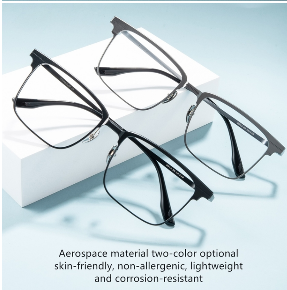
Aerospace material two-color optional skin-friendly, non-allergenic, lightweight and corrosion-resistant