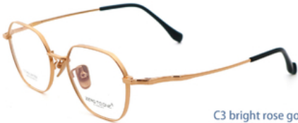
C3 bright rose gold 亮玫瑰金