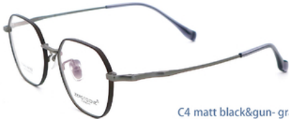
C4 matt black&gun-gray 磨砂黑&枪灰