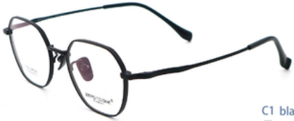
C1 black 黑