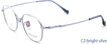
C2 bright silvery 亮银