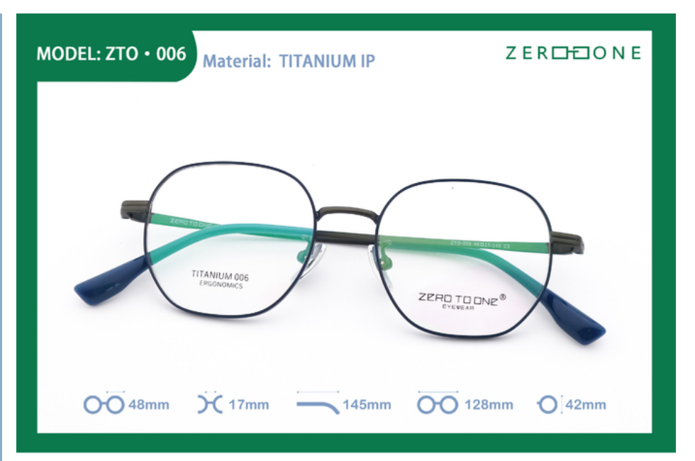
Zero To □ne ——从无到有,创造你的无限可能