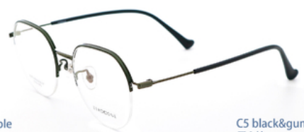
C5 black&gun- 黑&枪