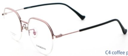
C4 coffee purple 咖紫