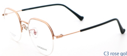
C3 rose gold 玫瑰金