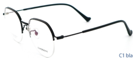
C1 black 黑