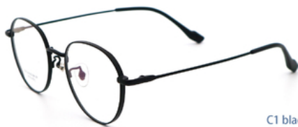
C1 black 黑