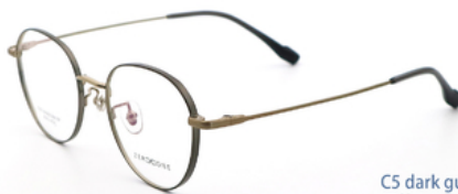
C5 dark gun- 深枪