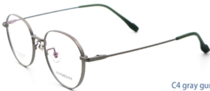
C4 gray gun- 灰枪