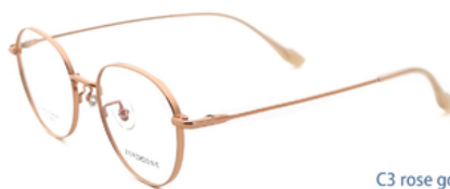
C3 rose gold 玫瑰金