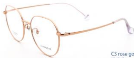
C3 rose gold 玫瑰金