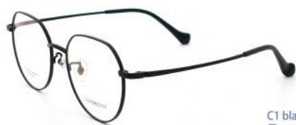
C1 black 黑