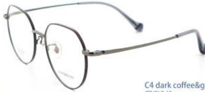
C4 dark coffee&gun 深咖&枪