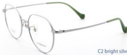
C2 bright silvery 亮银