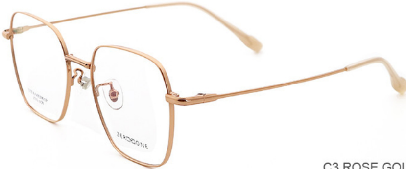
C3 ROSE GOLD