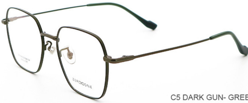
C5 DARK GUN- GREEN