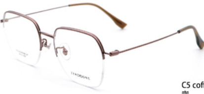
C5 coffee 咖