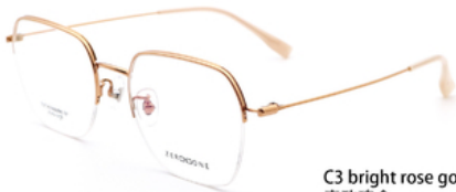
C3 bright rose gold 亮玫瑰金