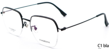
C1 black 黑