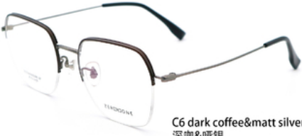
C6 dark coffee&matt silvery 深咖&哑银