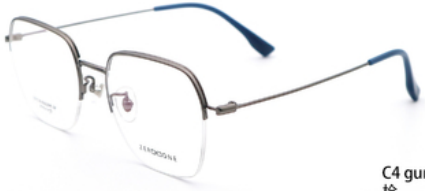
C4 gun- 枪